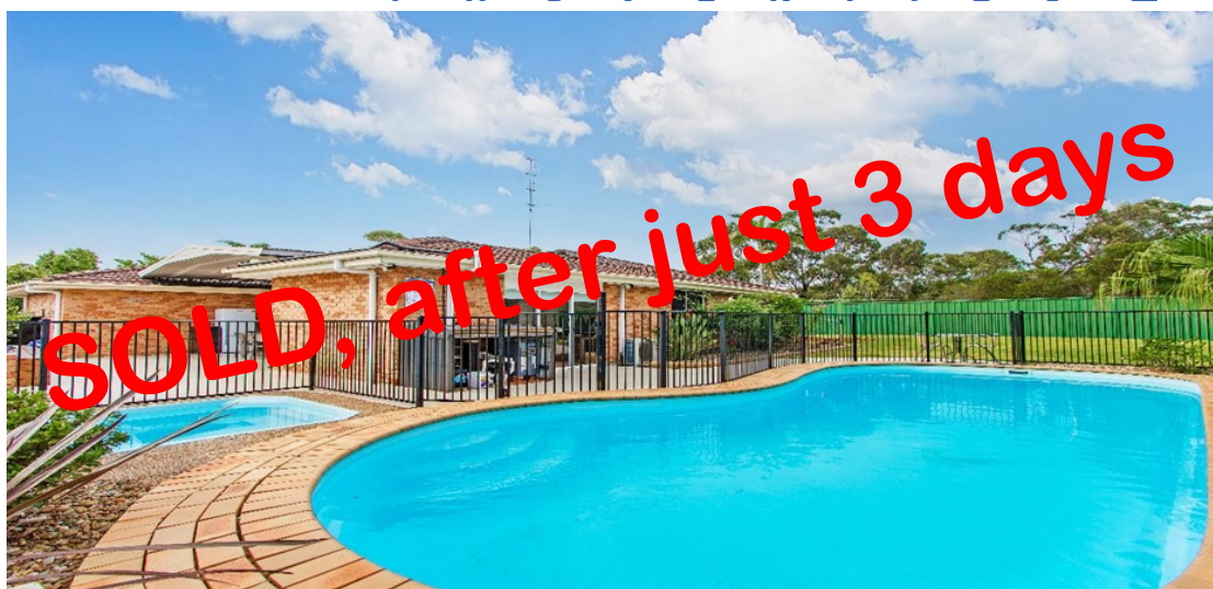
Feature Listing!!!! 16 Hayter Close. Kariong

Tucked away at the end of a quiet cul de sac location and backing on to National park this thoughtfully designed home represents an outstanding lifestyle opportunity. Multiple living areas that capture an abundance of natural light all on a level 1059sqm parcel of land make this an ideal family retreat.